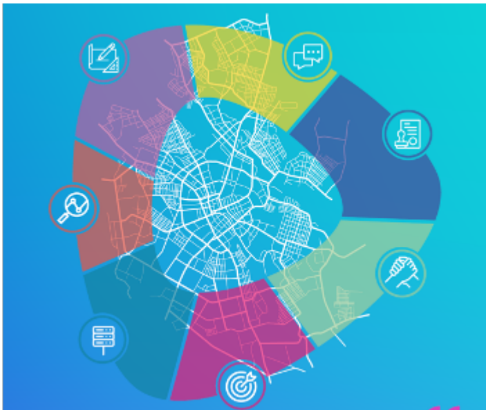
Figure 1 Steps to follow for the design and implementation of an EPZ. Source: link

With the implementation of Low Emission Zones in full swing, in recent years there has been a succession of news of the approval and rejection of several of them throughout Spain. And the fact is that, just like the Tobacco Law in its time, Law 7/2021 on Climate Change and Energy Transition, which regulates the obligatory nature of LEZs, directly affects individual habits and "rights", leading to a polarisation of opinions and defensive behaviour on the part of the population in the face of this new development.