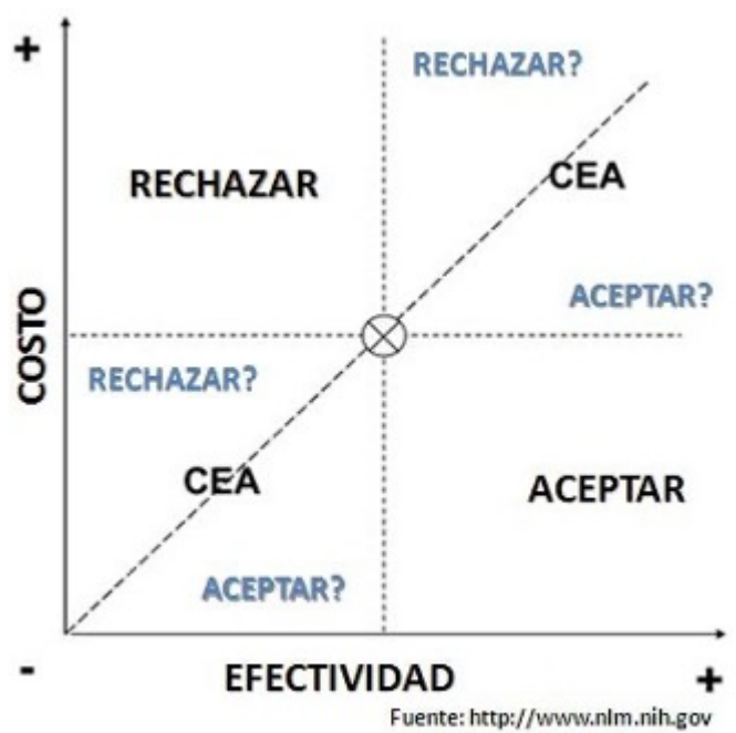
Figure 3 - Cost-benefit/effectiveness analysis.

The aim is to provide a diagnosis in order to consider whether the standard is based on the best option to achieve its objective, as well as to provide a scenario to formulate corrective and/or complementary measures to help minimise negative impacts.