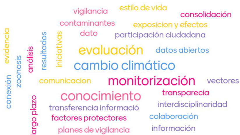
Illustration: Google DeepMind, Unsplash